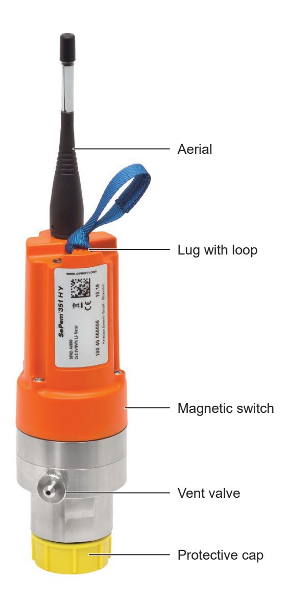
Fig. 2: SePem 351 HY logger